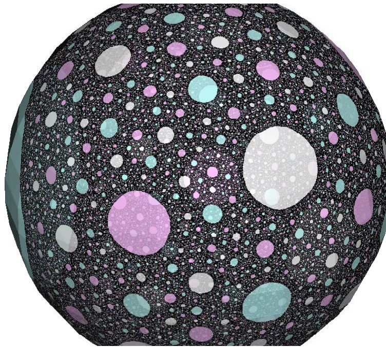
FIGURE 1. Julia set of Cui's map