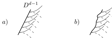
FIGURE 1. Front projection of a fold and the modified fold.

together with a lift D^{d-1} \times [-1, 1] \times D^{2k} \rightarrow Q \times \mathbb{R}^{2k} such that in this local