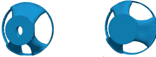
FIGURE 1. Example of minimization of the volume under a bound on the expectation of the L^6 norm of von Mises stress.

because one of the main concerns in the design of structures is to avoid the high concentration of mechanical stresses, in order to avoid damage or cracking of the object.