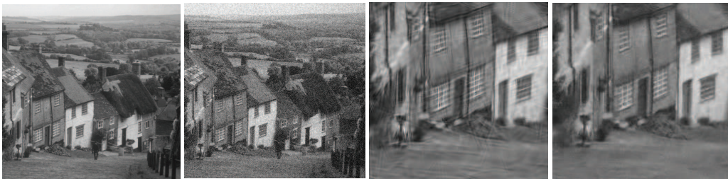
FIGURE 1. Denoising of the Goldhill image ( 512 \times 512 ) using shearlets and curvelets. Left to Right : Original image, Noisy image (PSNR 20.17 dB), Curvelet-denoised image (PSNR 28.70 dB/ Computing time 7.22sec), Shearlet-denoised image (PSNR 29.20 dB / Computing time 5.56sec).

Shearlet theory has applications in various areas. we will now present two applications: Denoising of images and geometric separation of data. First, to illustrate how shearlets perform in image denoising, we have included a denoising example of the Goldhill image using both curvelets 1 and shearlets, see Figure 1. We omit