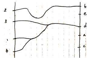
FIG 1. Sticky paths.

Its objects are pairs (S, \phi) with S a finite set and \phi : S \rightarrow M an embedding. A morphism from (S, \phi) to (T, \psi) is a pair (u, p) with u : S \rightarrow T a map of finite sets and p a “sticky” path connecting \phi to \psi \circ u in the space M^S . The sticky condition means that points are allowed to collide along the path but once this has happened, they remain stuck together for the rest of the path.