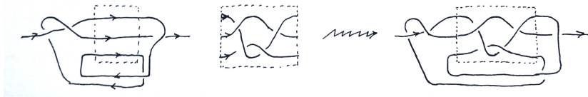
FIG 2. Pure braid infection and additive knot invariant.

Using these ideas, in [BH20], we are able to obtain new results in classical and higher dimensional knot theory.